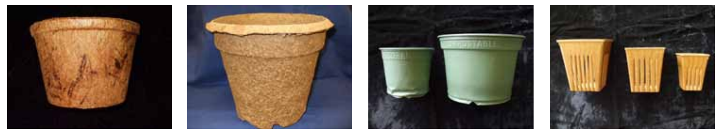
Figure 2. Some alternative containers are made from wood fiber, recycled paper or cardboard.

Containers made from these alternative components usually are compostable but may not biodegrade quickly when planted. Biodegradable (plantable) containers are left on the root ball when planted into the landscape or another larger container. They are usually designed to allow roots to penetrate container walls and to decompose quickly after planting. Compostable containers must be removed before planting and are designed to be broken apart and composted.