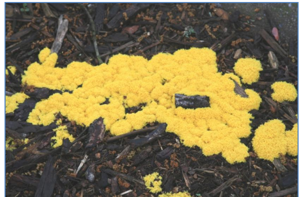
Bright yellow plasmodium of Fuligo septica on mulch.

I've been getting quite few calls and emails about slime molds and various other fungi in landscape beds and on plants. The wetter than average spring has created the perfect conditions for fungal (mushroom) growth. Slime molds are a diverse group of myxomycetes that are not true fungi because they lack a cell wall. Slime molds grow on decaying organic material, such as bark/wood mulch, thatch in turf and on rotting leaves. They actually live off bacteria found on the decaying material. The most common slime mold we see is Fuligo septica or what probably is the least appealing common name for a fungus, "the dog vomit slime mold." Fuligo and other plasmodial slime molds resemble a "blob" and can be brightly colored (see image of Fuligo septica above). They are a mass of cells that are initially soft that can actually creep across a surface as it ingests its mostly bacterial food source. They are only in this soft stage for about 24-48 hrs, then they become crust-like when their spores are produced. The crust-like slime mold breaks apart from rains, foot traffic, or from people like me who poke them. Then, they disappear only to reappear in another area when environmental conditions are conducive for their growth.