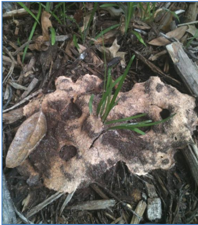
Crust-like, older, less colorful Fuligo septica growing over a liriopse plant (left; image by J. Williams-Woodward) and stalked slime mold of most likely Stemonitopsis sp. growing on a climbing fig leaf (right; image by James Jacobs, CEC Pierce County) .

Although the plasmodial slime molds are commonly seen, there is a group of slime molds called "stalked slime molds" that I have received several emails about. The stalked slime molds are seen on turfgrass blades or on leaves of trees and shrubs. I believe the ones that I have seen recently in images from agents are Stemonitopsis sp. Just like the other slime molds, they are not harming the plants they are growing on and they will dry up and disappear with time.