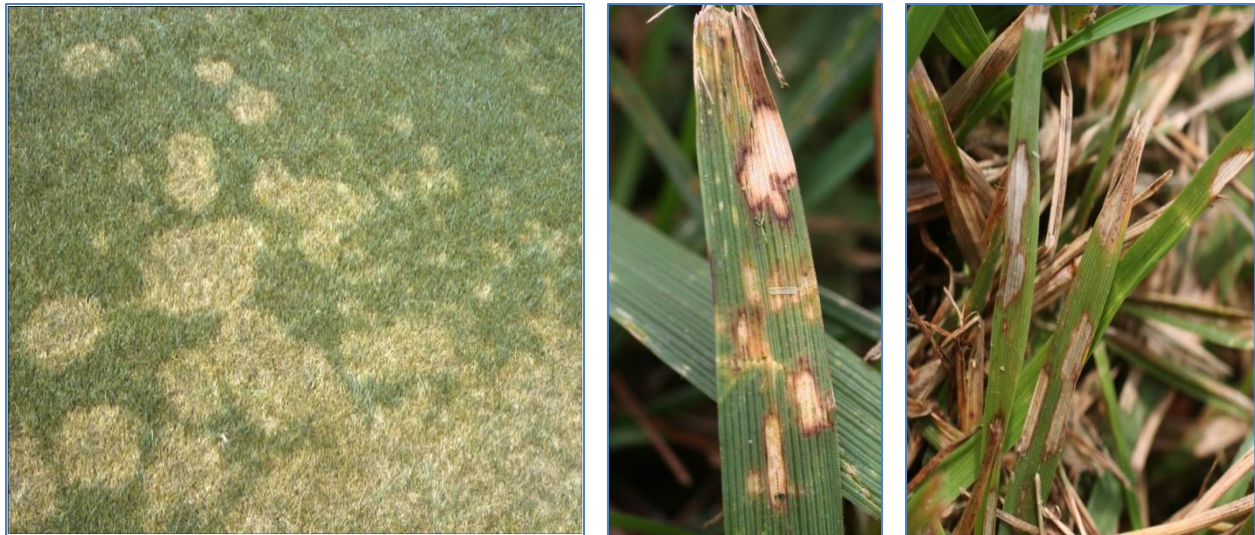
Brown patch on tall fescue.

It's time to scout for Brown patch (caused by Rhizoctonia solani ) and Pythium blight (caused by Pythium spp). These diseases are often the most serious diseases on cool season grasses, especially on tall fescue and ryegrass. Brown patch can cause a foliar blight, which results in necrotic leaves and circular brown patches up to 4-5 ft. in diameter. High soil and leaf canopy humidity, and high temperatures increase disease severity. Higher than recommended rates of nitrogen in the spring promotes disease. Management options includes: avoid nitrogen application when the disease is active, avoid infrequent irrigation and allow the foliage to dry, mow when grass is dry, ensure proper soil pH, thatch reduction, and improve soil drainage.