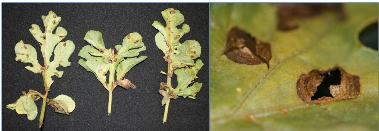
Gummy stem blight infected foliage has very distinct, conspicuous lesions that are round with a strong concentric ring pattern. Pycnidia (fungal fruiting structures) can be seen within the lesions (above right).

The current weather pattern has been conducive to the development of gummy stem blight disease. Many times the disease attacks the mid vein of the leaf and causes it to break. The main signs of gummy stem blight are the dark, round pycnidia often found in the center of foliar and stem lesions. Most growers have been spraying products like chlorothalonil and tebuconazole for this disease, and they typically work really well. With the current warm and potentially wet weather pattern moving in, it may be prudent to apply preventive fungicide sprays of products that have more efficacy against gummy stem blight. Products that have worked well in my trials include Inspire Super, Switch, and Luna Experience. Although Fontelis has looked good in programs where it is tank-mixed with chlorothalonil, resistance of the gummy stem blight pathogen to the succinate dehydrogenase inhibiting (SDHI) chemistries in Fontelis, Endura, and Pristine has been widely observed across the southeast. With the current warm and wet weather, it may be prudent to apply preventive fungicide sprays targeting gummy stem.