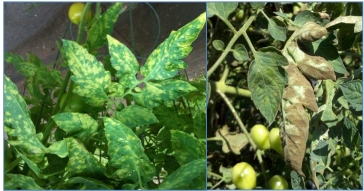
Yellow spots on the upper leaf surface (above left) and greenish-brown sporulation on the leaf underside (above right) due to leaf mold infection.

Management strategies for these diseases are similar and based on prevention. Most foliar tomato diseases survive on the infected plant tissues that fall to the ground during the growing season. Crop residues should be removed and destroyed at the end of the season to reduce the survival of the pathogens between crops. A three year rotation away from tomatoes and related crops is optimal and helps distance the plants from the sources of disease. Greenhouses and high tunnels should be thoroughly cleaned and rotated away from tomatoes and related crops whenever possible. Healthy plants are better able to resist disease, so good soil preparation is essential with adequate levels of organic matter and a balance of nutrients and pH (based on a soil test).