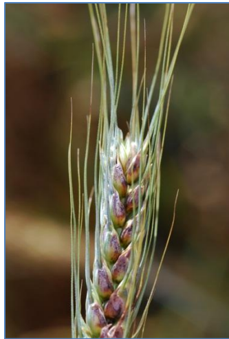
Stagonospora on wheat spikes

Leaf and glume blotch caused by Stagonospora nodorum (image to left) and barley yellow dwarf virus (BYDV) were observed throughout the state and seemed more prevalent than previous years. A couple of incidences of loose smut and take-all were also registered.