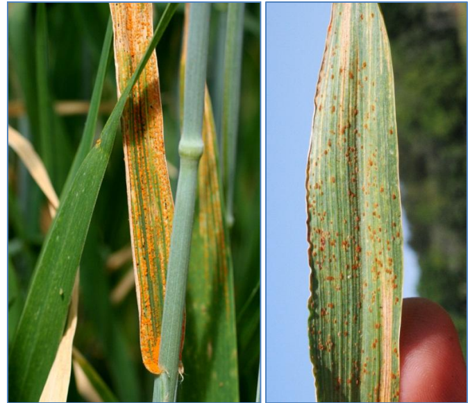
Stripe rust (left), leaf rust (right) on leaves.

Stripe rust caused by Puccinia striiformis was observed in many Georgia wheat-growing counties. The first incidences of stripe rust were located in southwestern Georgia and progressed rapidly to other growing areas. Unusually wet and cool spring weather drove and sustained stripe rust incidence and severity. Fungicides were used throughout the state to stop or prevent stripe rust epidemics. Leaf rust ( Puccinia triticina ) incidence was minimal; presumably due to the wide spread fungicide use against stripe rust as well as weather patterns. Take a minute to review the 2012-13 Wheat Production Guide and/or the 2013 Georgia Pest Management Handbook for disease and fungicide information and fungicide selection. Look for the updated information in these publications early in the next growing season. More information on identification and control of stripe rust can be found at: