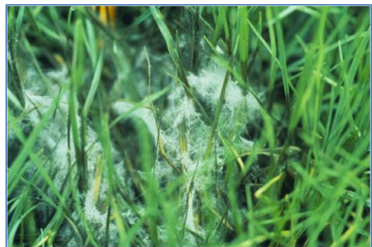
Pythium blight on tall fescue

Pythium blight has the potential to quickly cause significant damage to turfgrass. The disease starts as small spots, which initially appear dark and water-soaked. Affected turfgrass dies rapidly, collapses, and appears oily and matted. White, cottony mycelia may be evident early in the morning. The disease is driven by hot-wet weather, which correlates with an increased stress on the turf. Similar environmental and cultural factors that encourage brown patch also promote Pythium . Therefore, cultural practices for control of brown patch will also help to minimize Pythium blight development. A correct diagnosis is important because Pythium control requires specific fungicides.