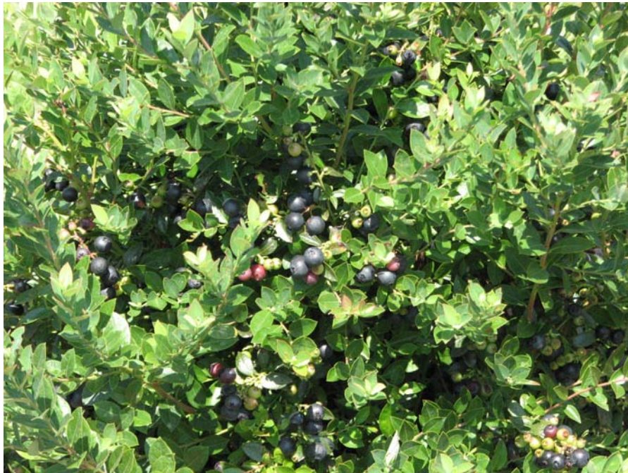
Figure 5. Close-up of flowers and fruit for the dwarf ornamental blueberry TO-1088.