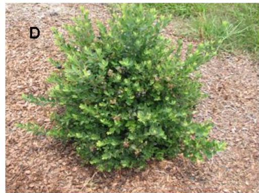
Figure 4. Dwarf ornamental blueberry TO-1088 development sequence at Alapaha, Ga. during 2009-2010. Sequence is A) August 18, 2009, B) January 20, 2010, C) March 23, 2010, D) May 26, 2010.