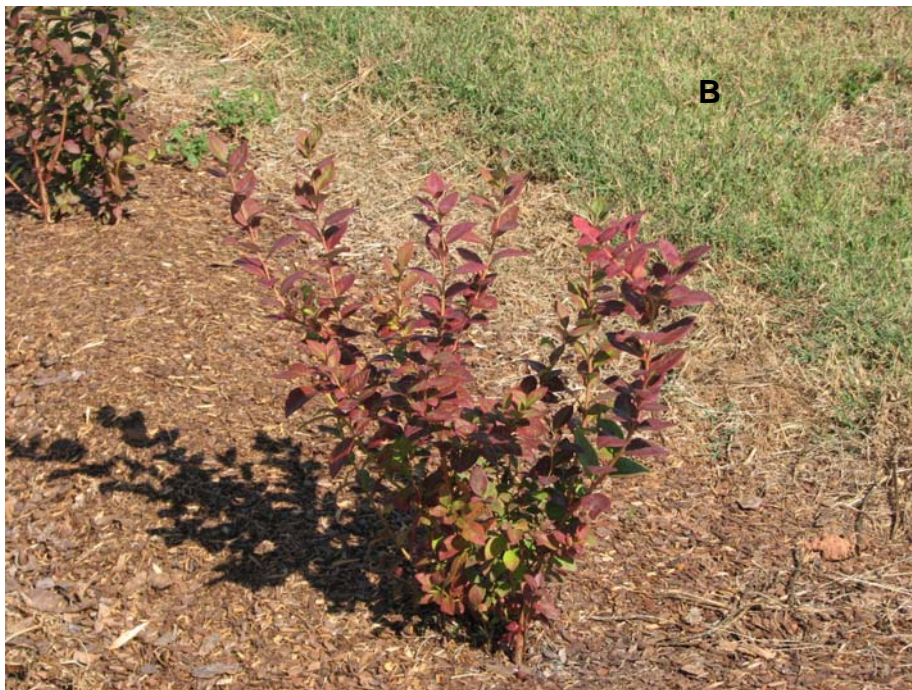
Figure 9. Blueberry selections with good development of Fall foliage color in 2010. Selections are TH-893 (A) and TH-1226 (B).