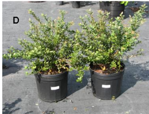
Figure 6. Plants of TO-1088 growing in pots at CANR site in Fall 2009 (A and B) and one year later in Fall 2010 (C and D).