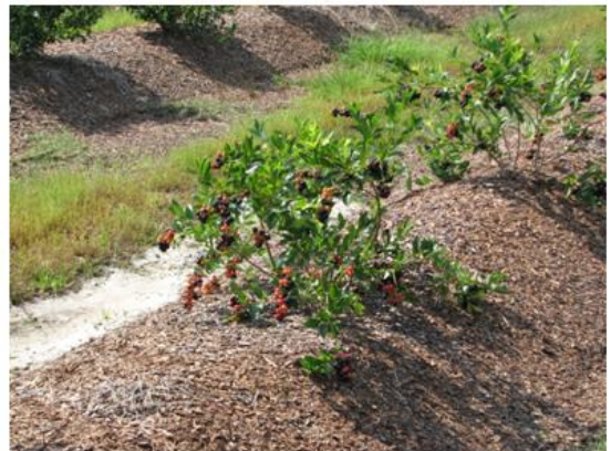
Figure 2. Several additional new ornamental blueberry selections with multi-colored berries.