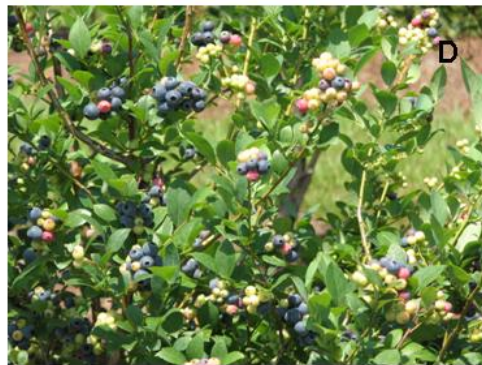
Figure 7. Two rabbiteye blueberry selections for possible ornamental use. T-877 (photos A and B ) has pink fruit contrasting blue. T-882 (photos C and D ) has multiple berry colors of light green, yellow, pink/salmon, and blue. Photos are from Alapaha site June 2010.