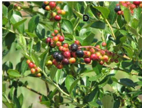
Figure 3. Colorful ornamental blueberry TO-1098 at different stages in Alapaha, Ga. during 2010. Sequence is A) and B) April 28, 2010; C) and D) June 16, 2010.