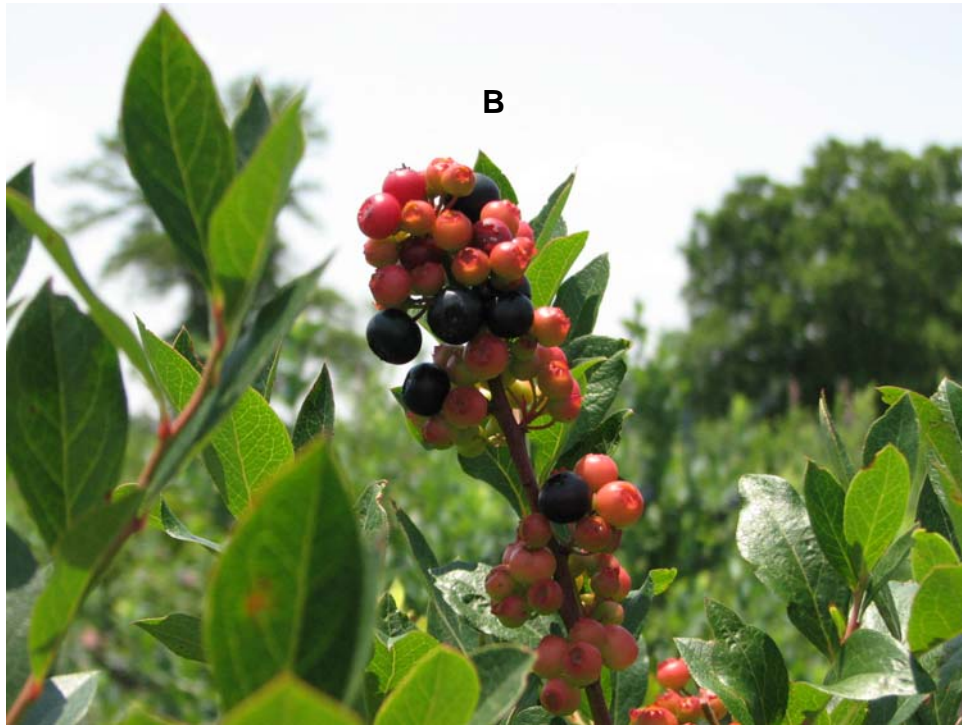
Figure 1. Summer Sunset ornamental blueberry plant (A) and fruit (B) growing in south Georgia during 2010.