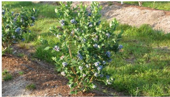
Figure 8. Additional dwarf and/or compact homeowner blueberry selections coming along.