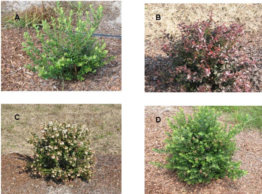
Figure 5. Dwarf ornamental blueberry TO-1088 development sequence at Alapaha, Ga. during 2009 and 2010. Sequence is A) August, B) January, C) March, and D) May.