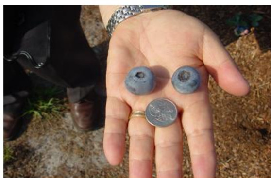
Figure 10. Blueberry selection TO-1202 (upper photo). Note miniature berries (bottom left) as compared to 'Titan' fruit (bottom right).