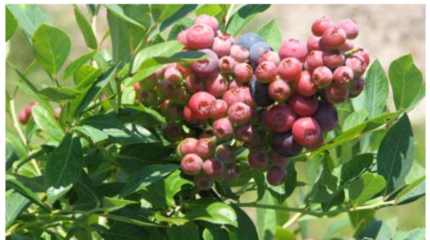
Figure 3. Several new ornamental blueberry selections with multi-colored berries.