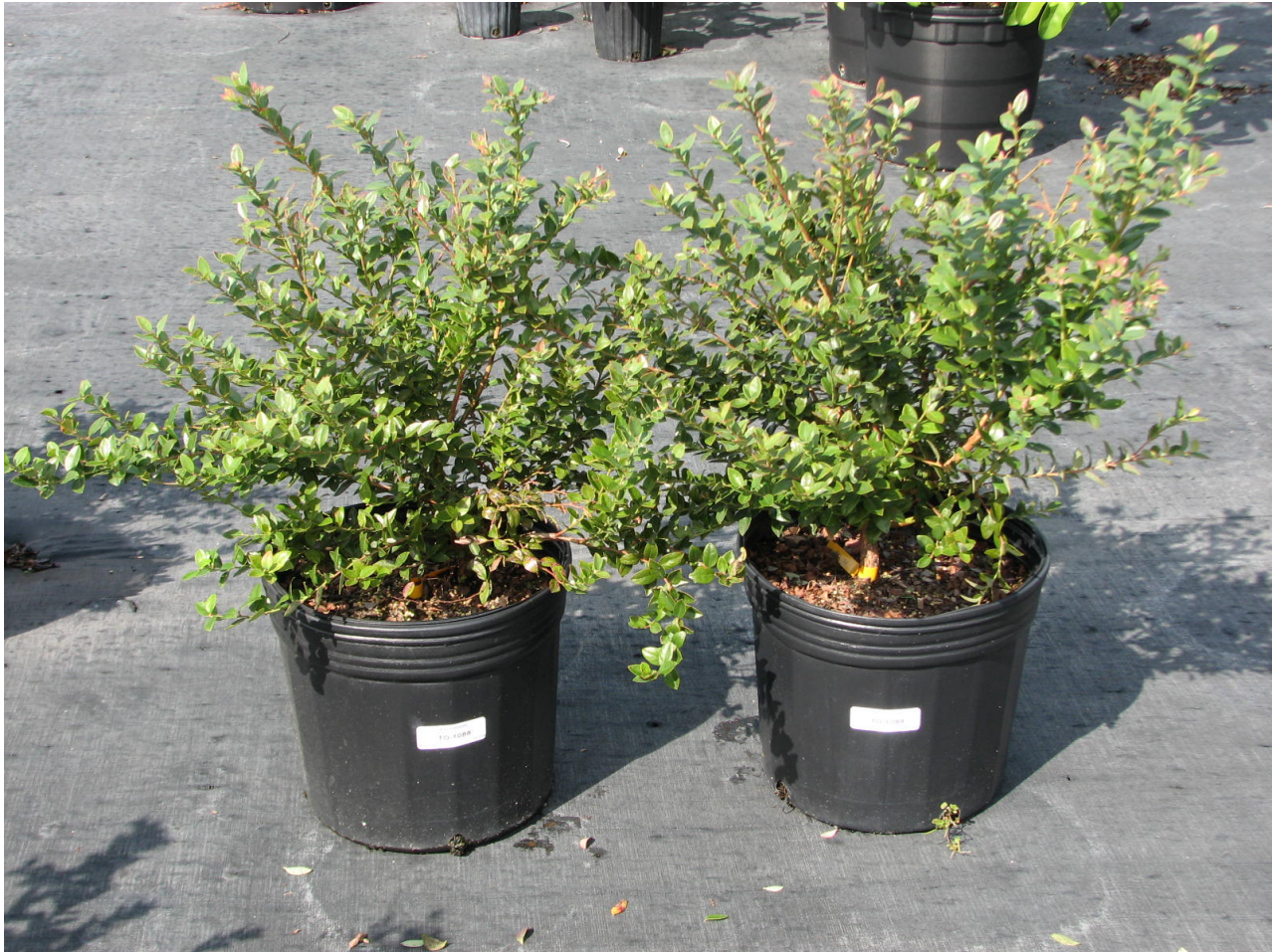
Figure 7. TO-1088 has good container growth and appeal too, as shown by these photos from the CANR test site in Fall 2010.