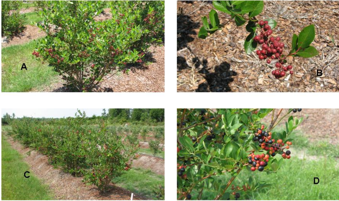
Figure 4. Colorful ornamental blueberry TO-1098 at different stages in Alapaha, Ga. during 2011. Sequence is A) and B) Mid-May; C) and D) Mid-June.