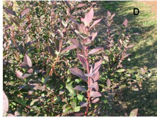
Figure 11. Colorful foliage for various 2011 ornamental selections, including TH-663 (A), TH-1236 (B), T-1223 (C) and TH-889 (D).