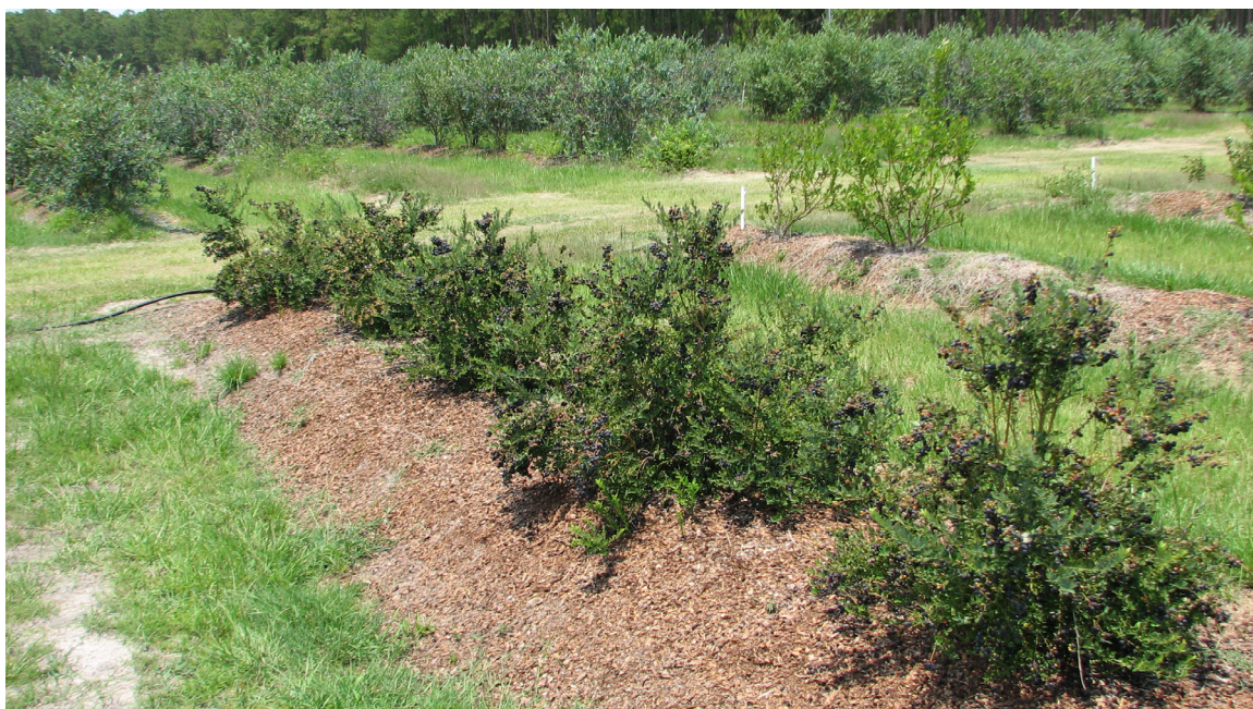
Figure 6. Close-up of TO-1088 during flowering and fruiting during 2011 in south Georgia.