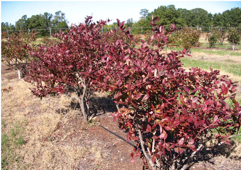
Figure 1. Blue Suede™ sky blue berries and colorful fall foliage.