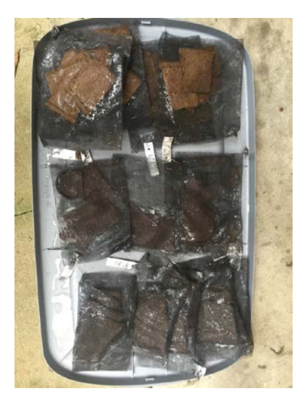
Figure 5. Mesh litter bags after washing of dirt sediments occurred.

Mesh litter bags collected during respective sampling dates were washed with deionized water to remove dirt sediments and placed in labelled brown paper bags [Great Value, 29.2 cm x 11.4 cm] for drying (Figure 5). Samples were placed in a drying oven for forty-eight hours at 60°C and weighed after a constant weight was obtained (Figure 6). The final weight represents the mass remaining after decay and hence from this, the percent of initial mass remaining can be calculated.