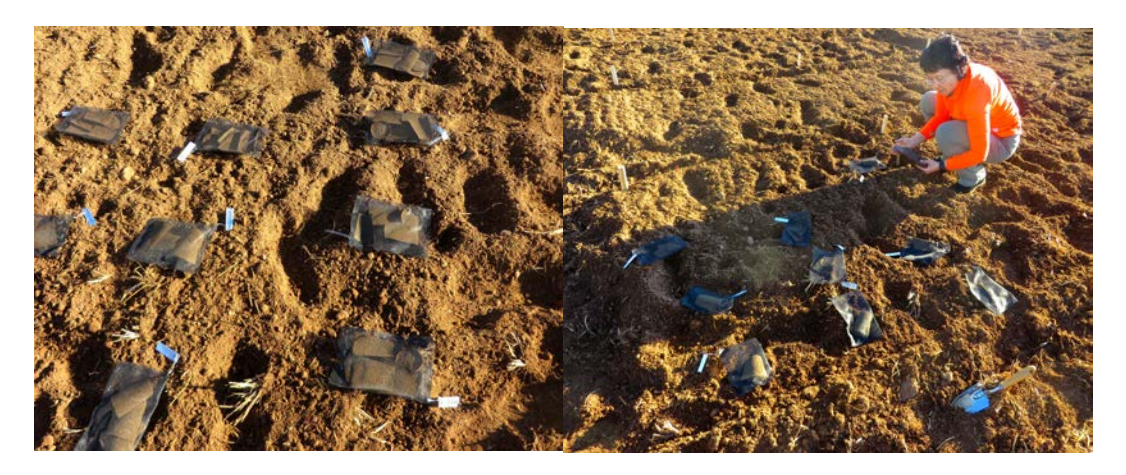
Figure 2. Placement of mesh litter bags at the University of Georgia Bledsoe (Pike Co, GA) and Dempsey (Spalding Co., GA) Farms.

Mesh litter bags for each container material (50 total), previously weighed in the laboratory, were placed in a randomized complete block design with five replications and ten sub-samples (Figure 2) in plots applied with 1 lb. 10-10-10 fertilizer/ per 100 sq. feet and no fertilizer application at two locations: the University of Georgia Bledsoe Farm (Pike Co., GA) (Figure 3) and University of Georgia Dempsey Farm (Spalding Co., GA) (Figure 4) on October 21-23, 2015. Sampling will occur every month for ten months until all sub-samples were collected.