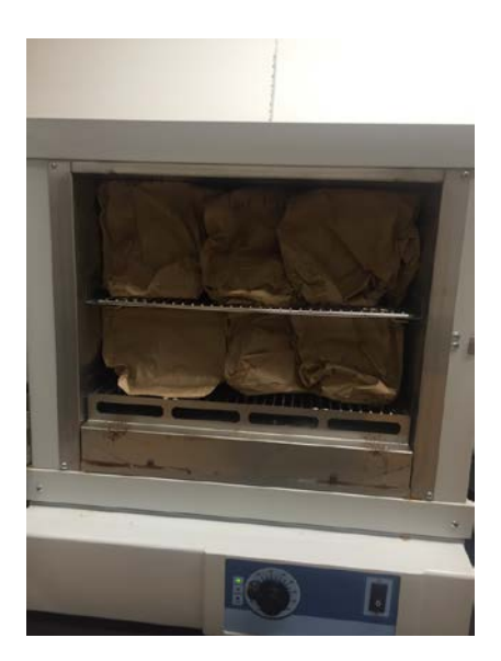
Figure 6. Biocontainer samples placed in drying oven for forty-eight hours at 60°C.