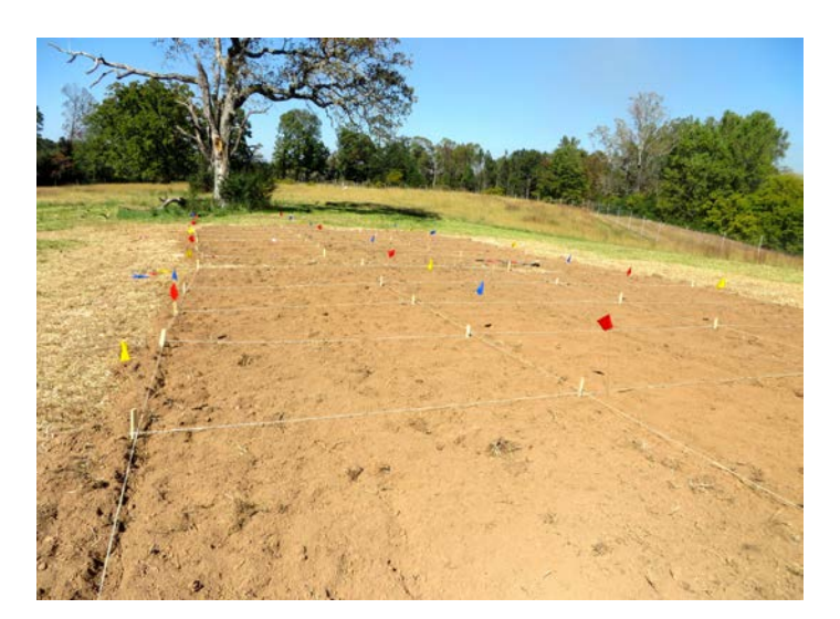
Figure 4. Plots with and without fertilizer application at the University of Georgia Dempsey Farm (Spalding Co., GA).

Figure 3. Plots with and without fertilizer application at the University of Georgia Bledsoe Farm (Pike Co., GA).