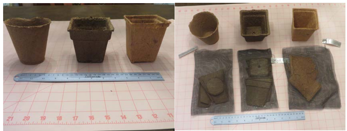
Figure 1. Cowpot, Fertilpot, and Coconut Coir pot containers placed in mesh bags designed from mesh fiberglass screen.