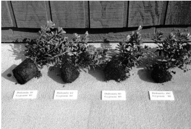
Photo 1. Hinodegiri Azalea Root Development at 4#, 6#, 8# and 10# / yd 3 of dolomitic lime on 11/11/98